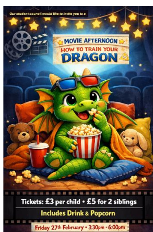
Movie evening poster.

This term we are planning to do a whole school movie night, which will take place on Friday 27 th February 2026. We will be watching How to train your dragon 2025 edition – a PG film. Our suggested donation is £3 for one child or £5 for 2 siblings. We are starting the film at 3:30pm and finishing at 6pm. So far, we have raised 28% of the money we need.